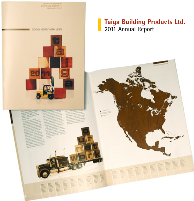
Taiga Building Products Ltd. 2011 Annual Report