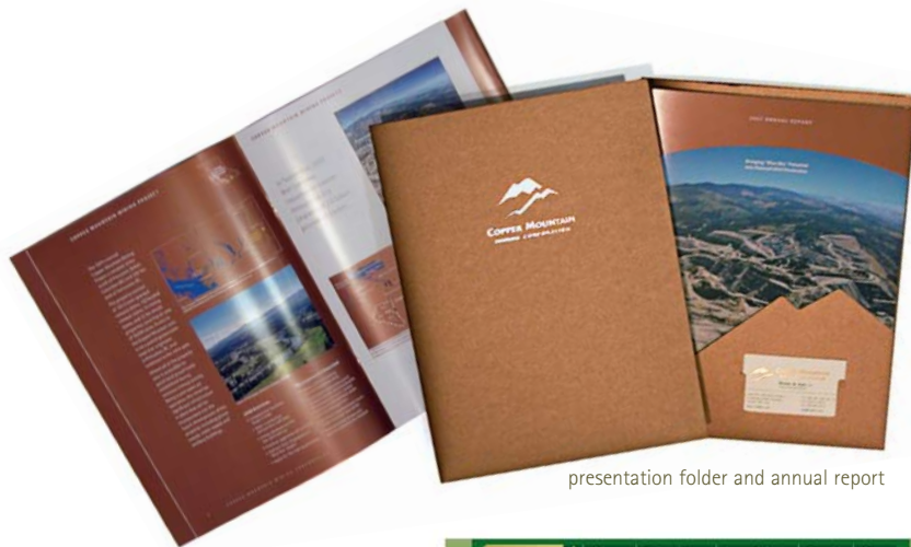
presentation folder and annual report